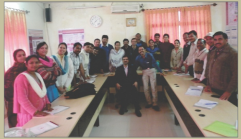
Devi Ahilya University, M.P.

More than 2000 Participants of “Emotional Intelligence for Teachers” course, experienced paradigm shift in their perspective towards life and job.