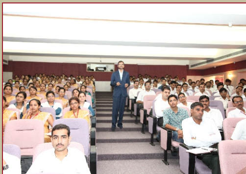
Atmiya Group of Institutes, Rajkot