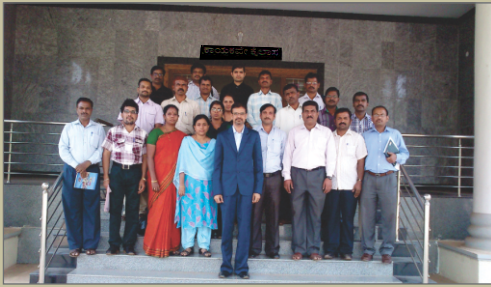
Karnatak University, Karnatak