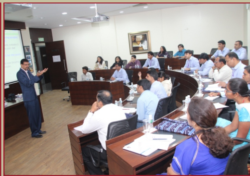
Adani Foundation, Ahmedabad